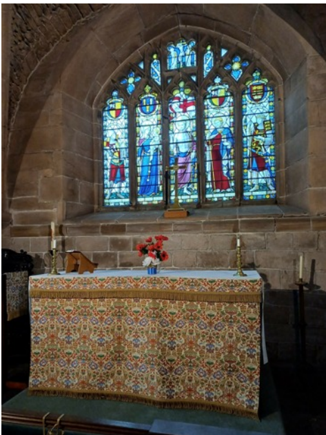
Stained glass window in Chapter House, by Ninian Comper