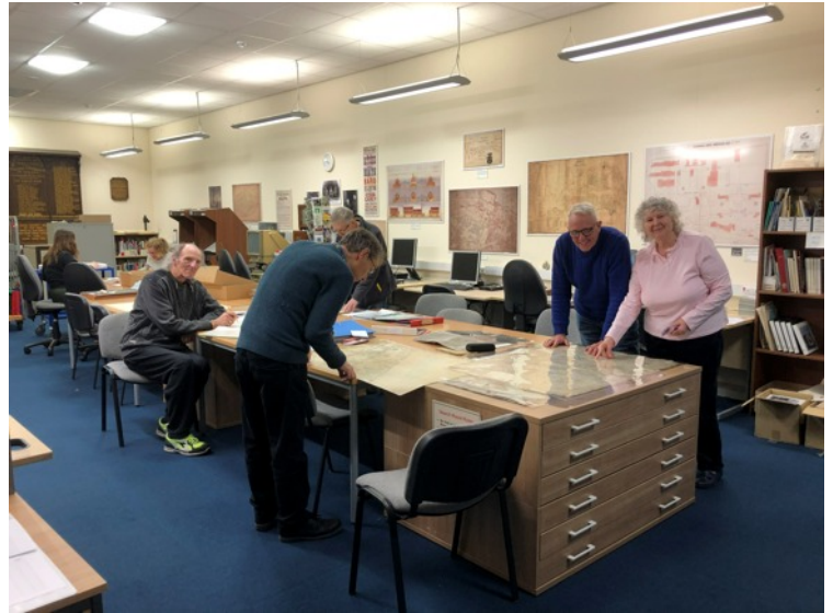
Students viewing the archives.

The new House History course saw learners visit Wirral Archives to explore the different types of record that can be found to help in their research. We looked at maps, planning applications for alterations and local historical publications. The houses being researched include a 19th century farmhouse, Victorian townhouse, Edwardian terrace and 1930s semi detached houses. The course continues next term and new learners are extremely welcome'.