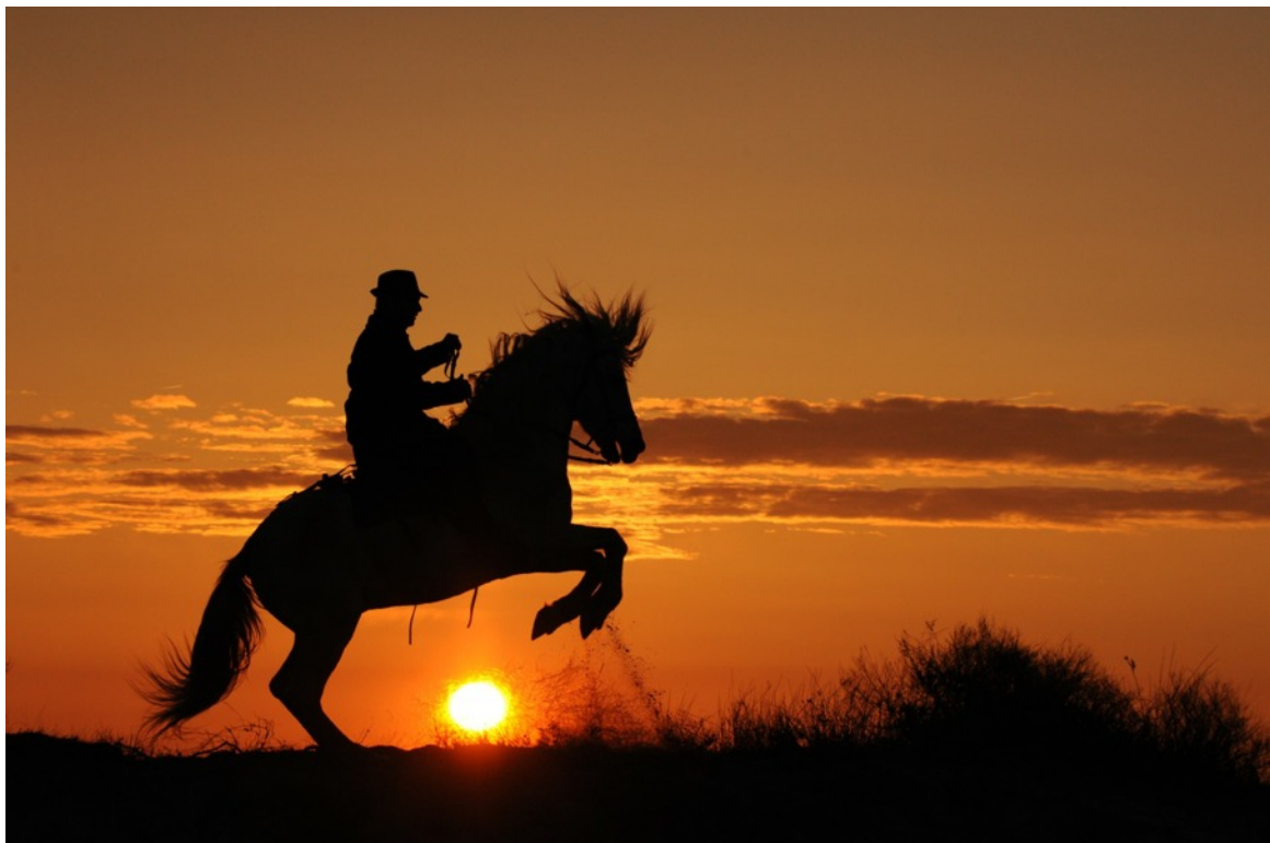
Horse and rider at sunset